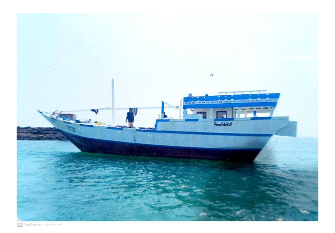
Figure 2. Image of Fishing Vessel "AL- HIDAYA 1".