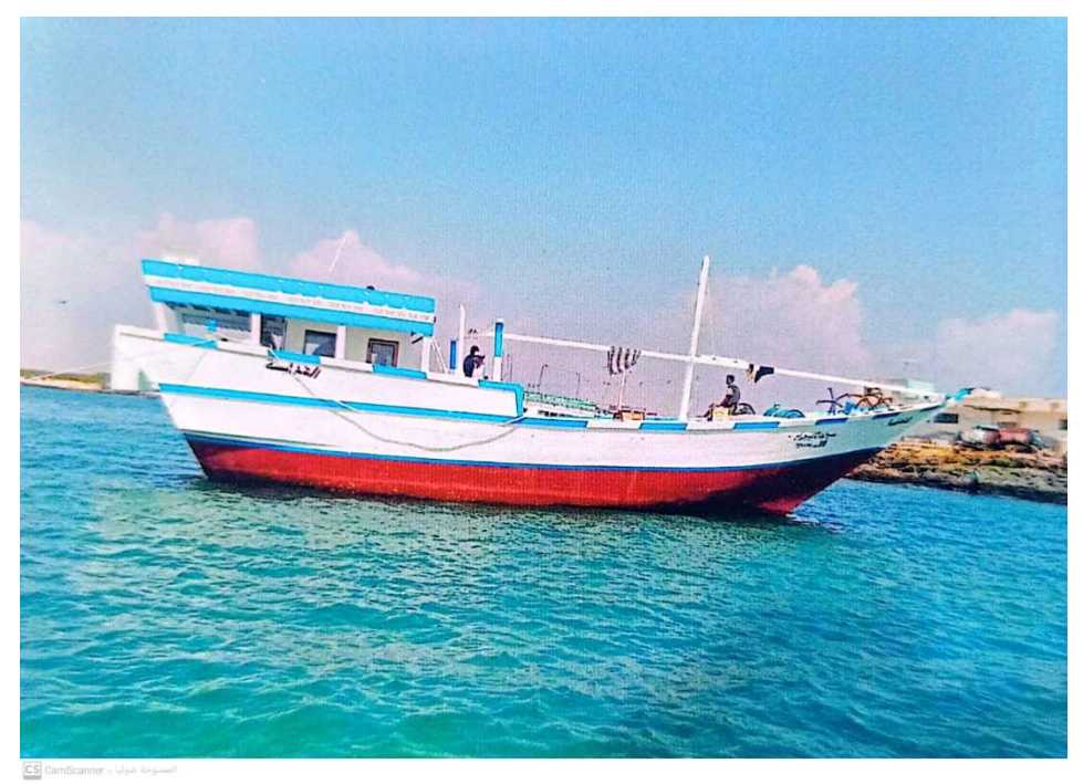
Figure 3. Image of Fishing Vessel "AL- HIDAYA 1".