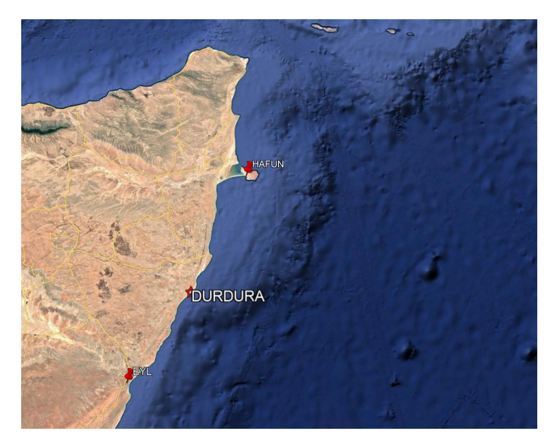
Figure 1. Surrounding position of the incident.