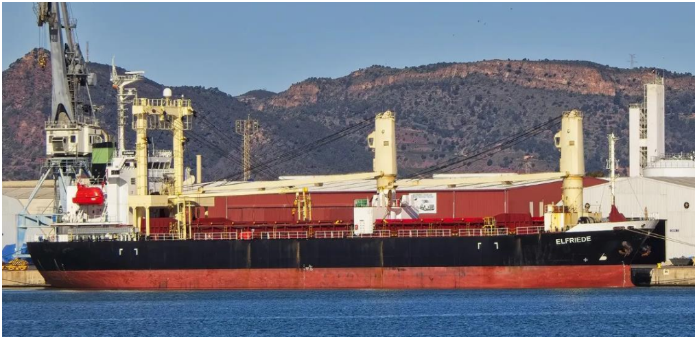
Figure 1. MV ELFRIEDE