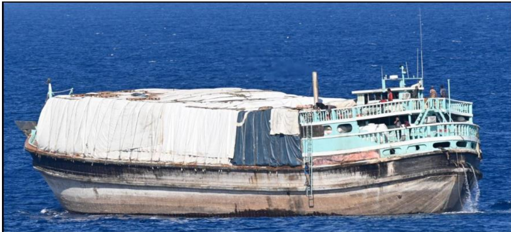
Figure 2. FV FAHAD 4