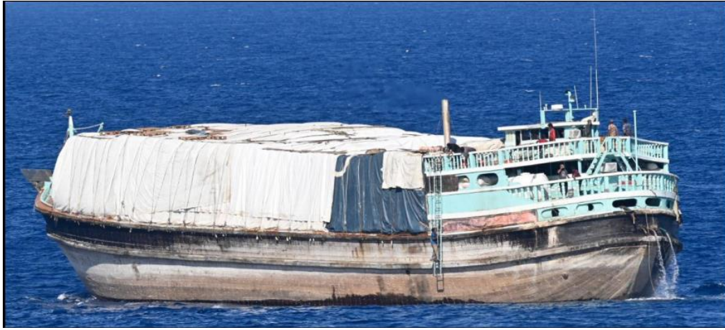
Figure 2. CD FAHAD 4

Event 2 – Cargo Dhow FAHAD 4 (TBV) , UAE flagged (MMSI 470007178)