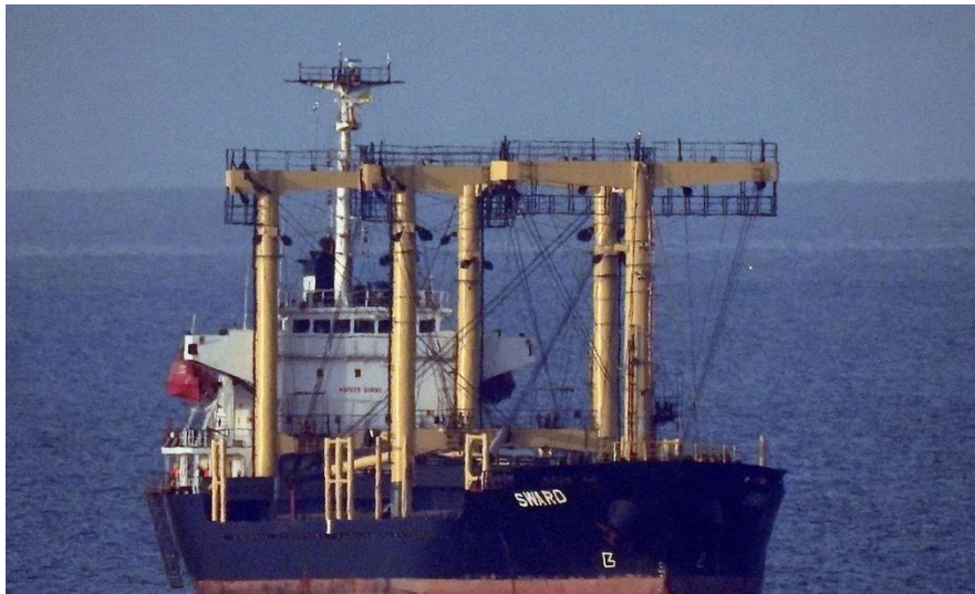
Figure 3. MV SWARD

Event 3 – MV SWARD , Syrian flagged (IMO:9174244, MMSI: 341338002)