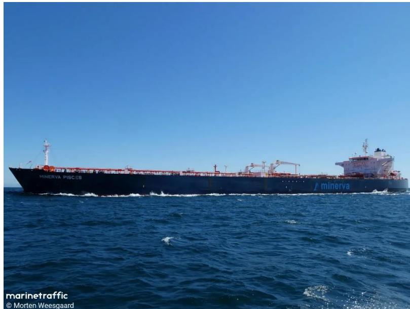
Figure 4. MV MINERVA PISCES