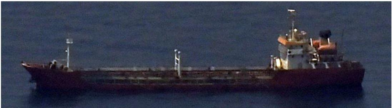
Figure 2. MV EUREKA

Event 2 – Oil Products Tanker "EUREKA", Togo flagged (IMO 1022823)