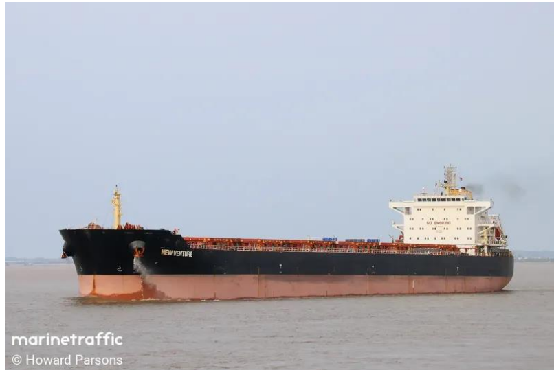
Figure 1. MV NEW VENTURE

Event 1 - Bulk Carrier "NEW VENTURE", Liberia flagged (IMO 9497622)