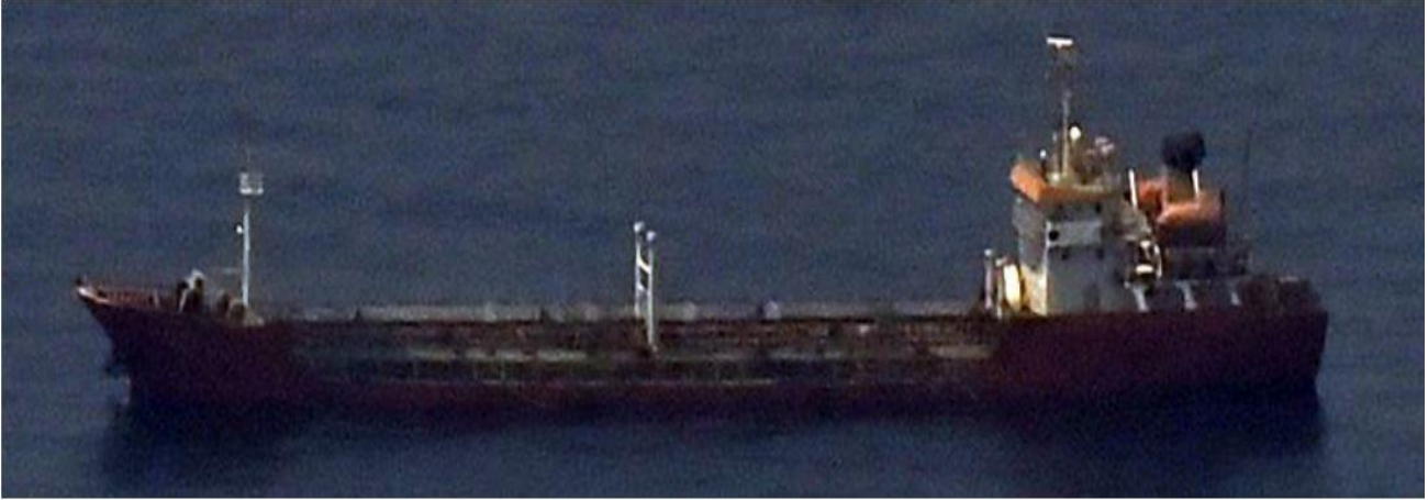
Figure 4. MT EUREKA