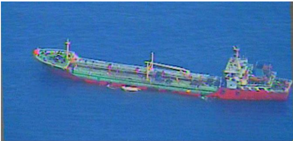
Figure 1. MT HONOUR 25

Event 1 – Oil Products Tanker “HONOUR 25”, Palau Flag (IMO 1099735)